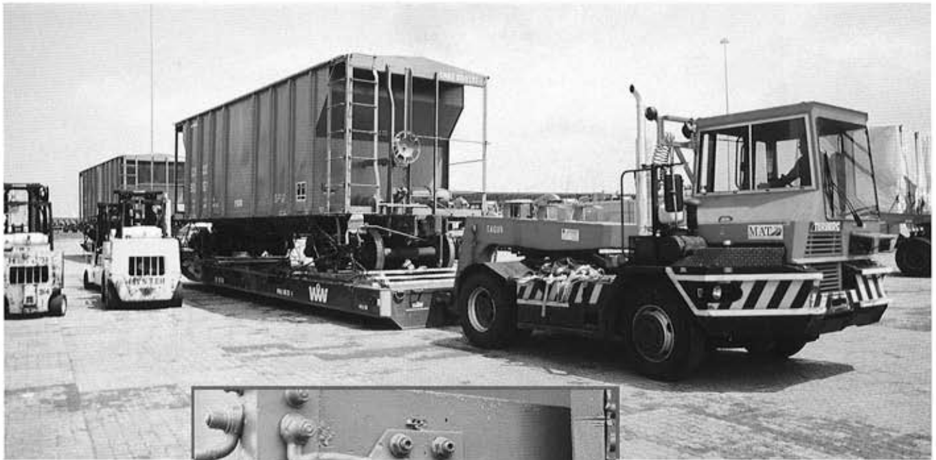
Fourteen rail cars were shipped to Australia in June.